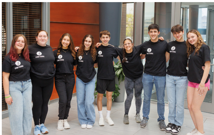
The B'nai Tzedek Youth Council