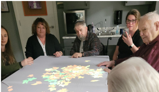
Village Shalom residents using their new virtual reality equipment